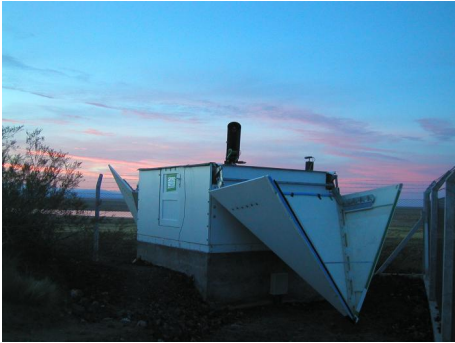
Figure 1: FRAM telescope and its enclosure during sunset at Los Leones site.

equipped with an electronic focuser Optec TCF-S. This Crayford-style motorized focuser is installed in secondary Cassegrain focus and bears the photometer on its moving end. A beam-splitting dichroic mirror is installed behind the focuser. The red and infrared light is reflected into narrow-field pointing CCD camera (Starlight XPress MX716) and ultraviolet and visible light passes through the mirror into the photometer.