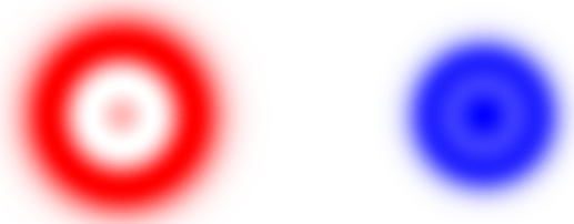
FIG. 2: The magnetic field (left) and the energy density (right) of the solutions of Eqs. (22) for the visible sector, with q, w = 1 and \beta = 20 . The darkness of the colors is directly related to the intensity of the quantities.