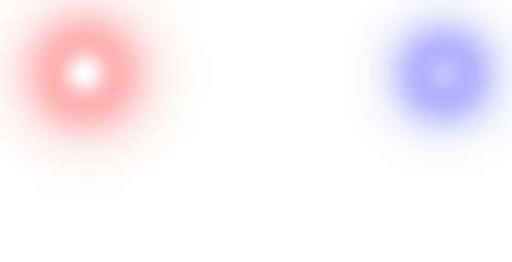
FIG. 4: The magnetic field (left) and the energy density (right) of the solutions of Eqs. (30) for the visible sector, with q, w = 1 and \beta = 2 . The darkness of the colors is as in Fig. 2.