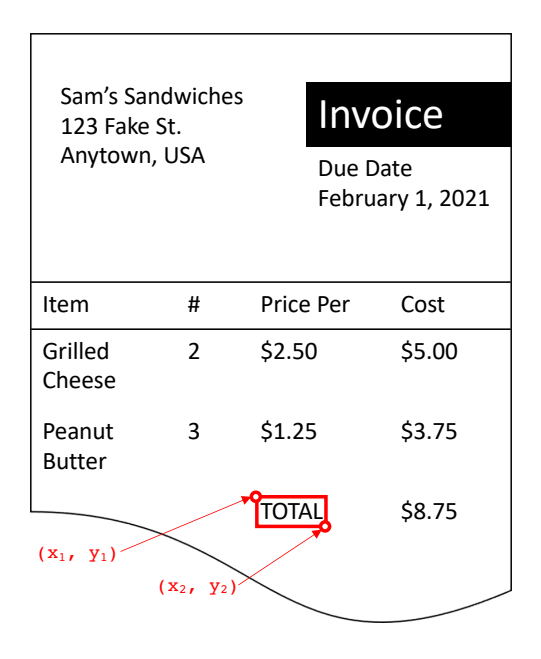
Figure 1: An example invoice, with one bounding box and coordinates shown. A human can use the positions of text to help determine the total cost.

This paper's contribution is a new pre-training task for layout-aware text embeddings: position masking. A masked language model (MLM) pre-training task, like that used by LayoutLM [17], masks token embeddings and tries to predict the correct token based on context—the unmasked components of the token, such as its position, and the other tokens in the input sequence. Our model additionally masks 2-D position embeddings and attempts to predict the correct position based on context. We show that